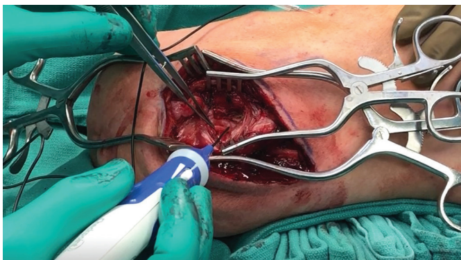
FIGURE 2. After dissection and definition of neuroma of deep peroneal nerve, the Checkpoint® nerve stimulator is used to map and identify the motor branches. Demonstrated is confirmation of proximal motor branches of the deep peroneal nerve with branches to extensor digitorum muscle body.